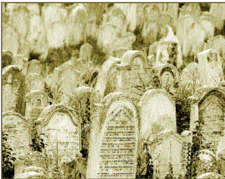
In spite of great advances in medicine, health care and sanitation, which have eliminated many of the devastating epidemics of the past, we still see much suffering and death from disease.

their will, live in virtual slavery, trapped by economic circumstances and long work hours while eking out a meager living. Such conditions crush the human spirit. Imagine a life bereft of joy, an existence in which people never enjoy such simple pleasures as the sound of