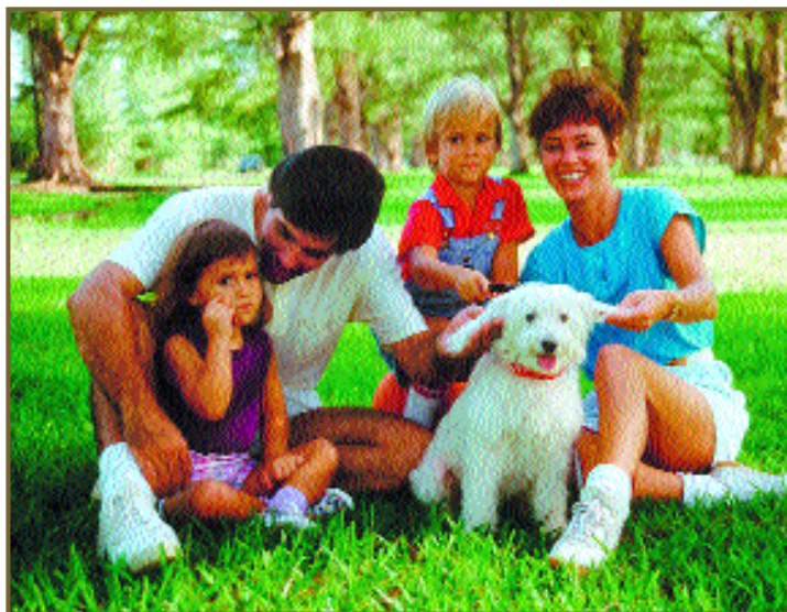
The world will finally see an end to suffering, but it won't be through human effort. Bible prophecy reveals how it will finally come about.

Michio Kaku, scientist, author and television host, writes that the "sheer