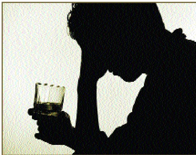
God allows suffering to continue for several reasons. The answer becomes clear when we put together many scriptures on the subject. Among the major causes of suffering are our decisions and actions.

As the book of Revelation explains, the tree of life symbolized obedience to God that would ultimately lead to eternal